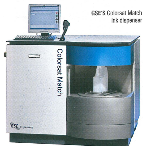
GSE'S Colorsat Match ink dispenser

for each job. It calculates the volume requirements for the most challenging spot recipes, dispensing a 5 kg batch to an accuracy of one gram in under four minutes. Excess ink that remains after a print run is reusable after retrieval from stock.