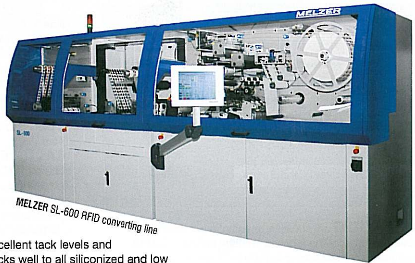
MELZER SL-600 RFID converting line

MACTAC EUROPE will present materials for a wide variety of market segments on stand 5C20. Velvet EF and Maccoat EF are the first FSC semi-gloss coated face paper grades including 60 percent of recycled fibers. They are complemented by the Mactab Biodegradable / MP198 adhesive (compliant with ISO14855 and EN13432 norm onto compostable packaging). A large selection of new products aimed at digital printing technologies will be on show, including the proprietary Indie range of HP Indigo certified paper and filmic materials as well as the range for Xeikon type dry toner presses. Other products include Mactac-Bemis U Coex55, the first thin film of a range of synthetic face materials jointly developed within the Bemis group. MP318N and MP318N UV are new versions of adhesives approved for some of the most demanding labeling applications in the pharmaceutical industry, now also available with a new 30 µm PET liner.