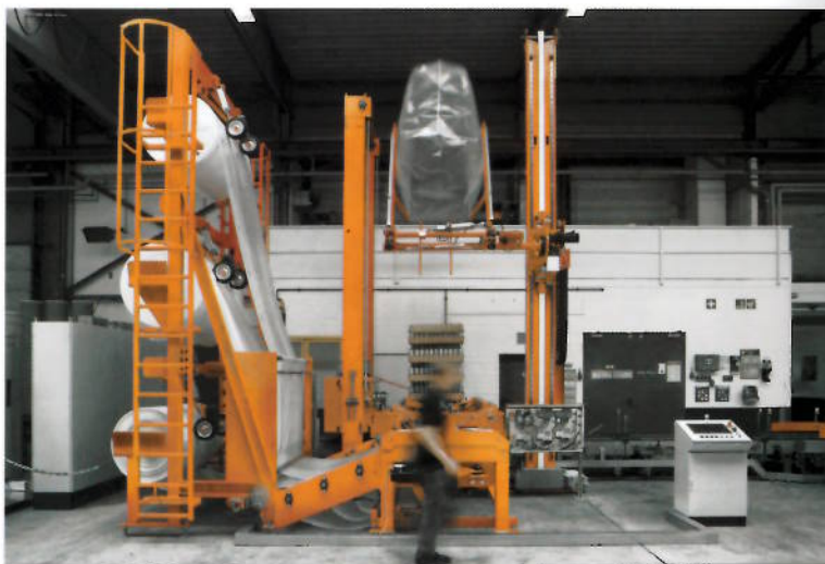
The latest generation MSK Paratech shrink hood applicator.