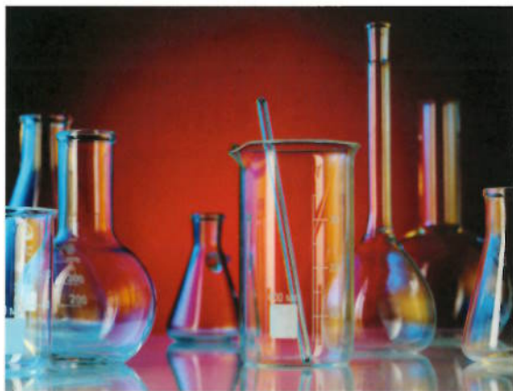
Marabu screen and pad printing inks for glass.

Marabu unveiled a series of innovations at glasstec, including the Ultra Glass UVGL range of inks, which create a silvery sheen that turns drinking glasses, bottles and flat glass into real eye-catchers. The second development was a thick film or tactile coating that when used to decorate drinking glasses, turns them into something distinctive, with tactile effects. Other Marabu highlights included high gloss metal effects created by hot stamping in conjunction with Ultra Glass UVGL primers, plus an innovative basis top coat for in-line foiling.