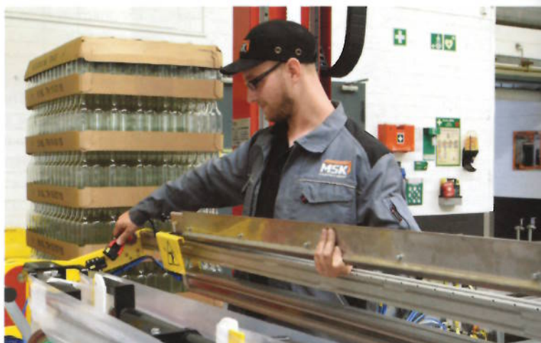
Simplified replacement of the welding bar on the MSK Paratech shrink hood applicator is possible thanks to specially developed plug-in connections.

MSK Covertech Group presented the latest generation of its MSK Paratech model. The secret of this shrink hood applicator's success is its simplicity and maintenance-friendliness. Following revision, the machine is now more efficient and is equipped with maintenance-free, hygienic toothed-belt technology. The latest drive technology ensures optimised acceleration and braking operations, which permits optimum dynamics during the hood covering process. For simplified replacement of the welding bar, the machine now has a quick-change mechanism with plug-in connections. >