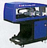
Kornit Paradigm Industrial digital printer for screen printing carousels. The only solution that combines the best of two worlds: screen printing and digital printing.