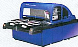
Kornit Storm The industry's trailblazer with a proven track record. World's best seller with over 400 units worldwide.