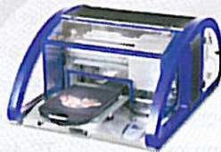
Kornit Breeze Industrial design for commercial use. The ideal printer for small to mid-sized businesses, online and retail shops.