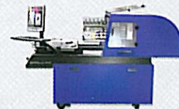
Kornit Thunder Industrial Direct-On-Garment digital printer for medium-level production businesses. Best selling digital garment printer in Germany.