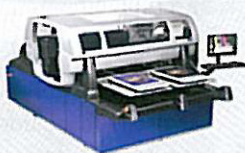
Kornit Avalanche Built for fast and mass production businesses. Designed with the largest image print area in the market place.